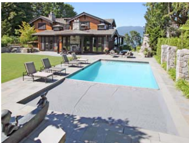
Light Gray #11