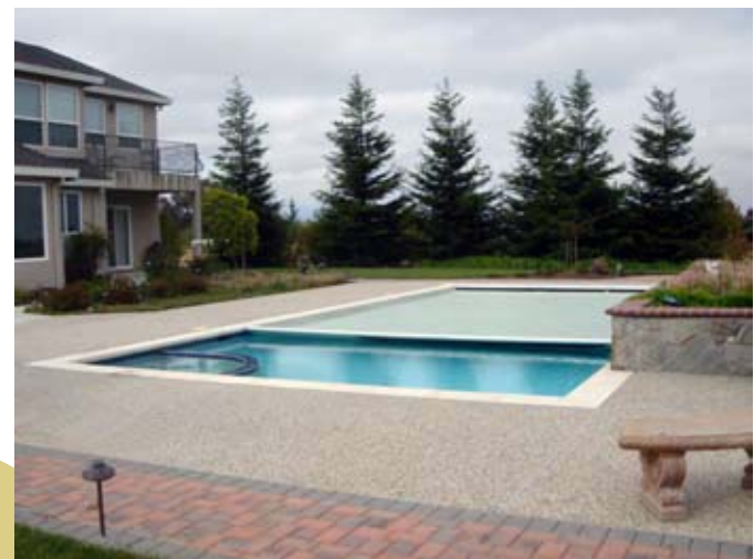
Sage Green #12