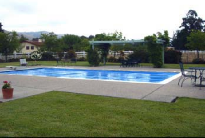
Light Blue #3