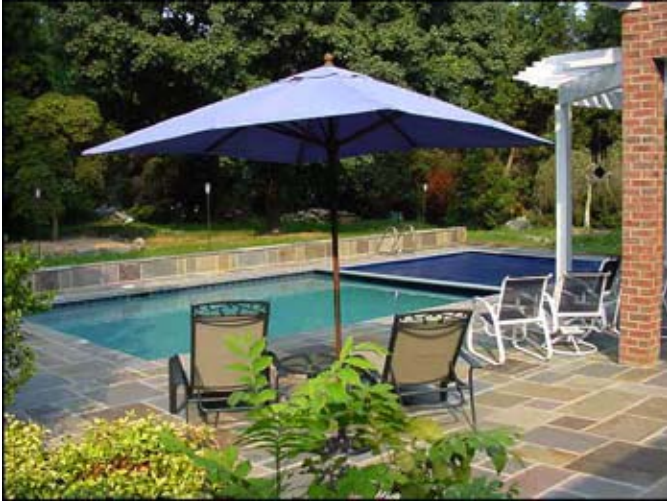
Navy Blue #1