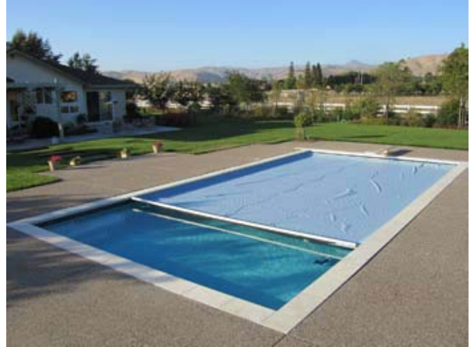
Powder Blue #2