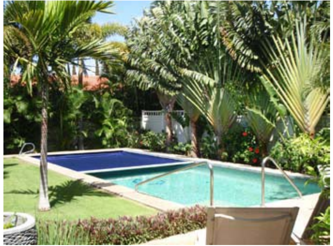
Royal Blue #2