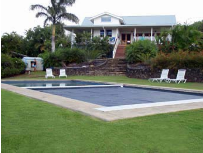
Washed Navy #1